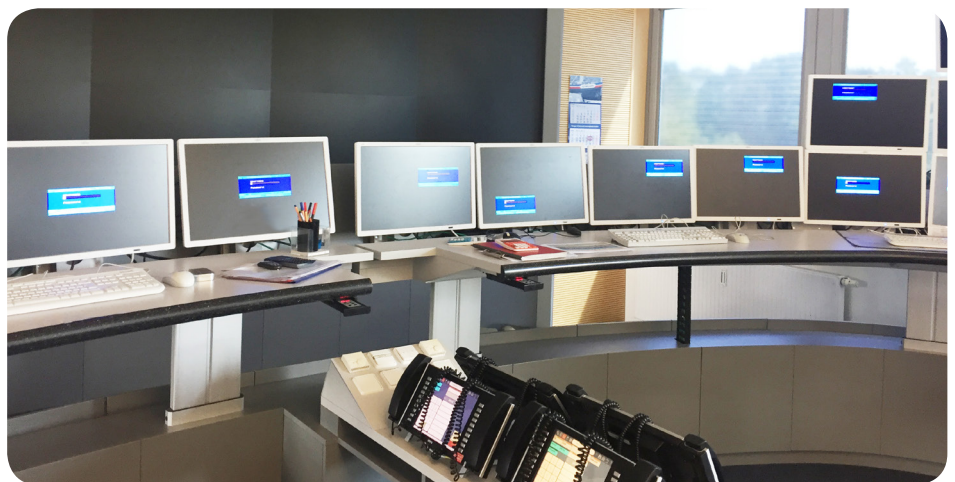
▲ Each dispatcher console is equipped with 14 displays.