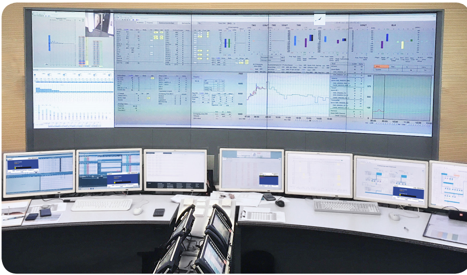
▲ Each computer can be displayed on one or across more cubes.

remote computers available at the consoles. It also offers maximum flexibility with regards to functionality and supported signals. The matrix switch was combined with VuWall's VuScope video wall controller, which allows flexible control of the large screen so that images can be enlarged over several cubes or only a small part of an image can be displayed.